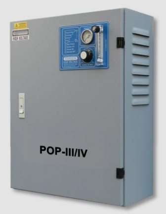
Ozone Generator View

The POP-III & IV are wall-mountable, air-cooled, CD type ozone generator packages specifically designed for swimming pool applications. The package incorporates CD type ozone generator with internal PSA oxygen module and with the main function of vacuum triggered system On/Off control & ozone safe interlock, external oil-less compressor, water backflow prevention device and venturi injector manifold. The ozone contacting vessel, degas valve and ORP controller are optional. These packages are capable of producing ozone in 10g/hr & 20g/hr.