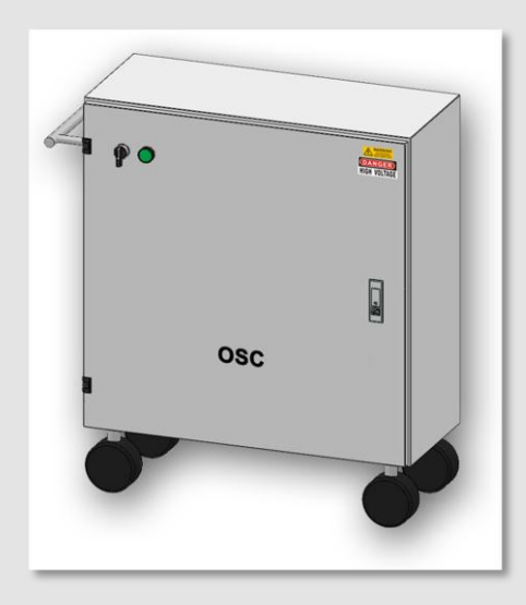
OSC System View