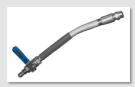
Fan Spray Wand View